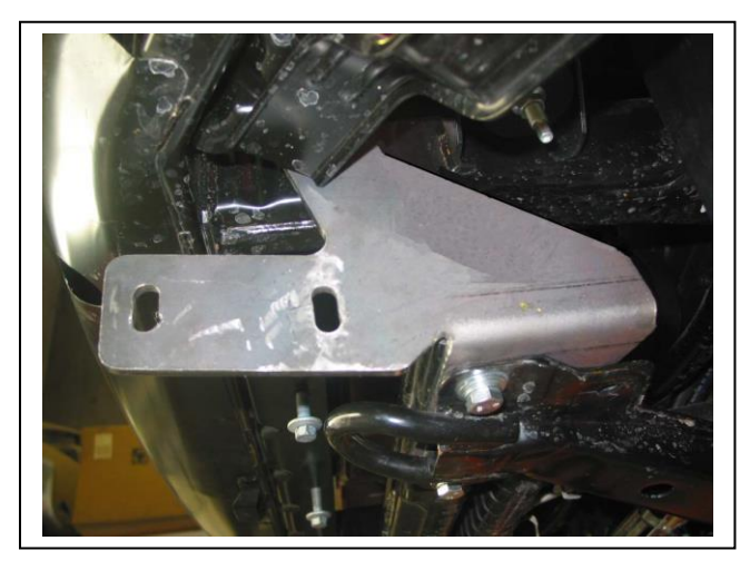
Figure 4: Steel mount bolted in position