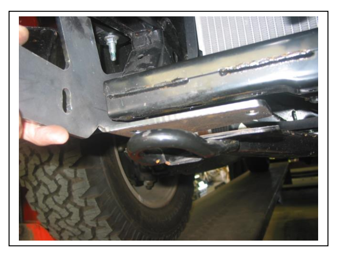
Figure 3: Fitting mount under stabilizer bar