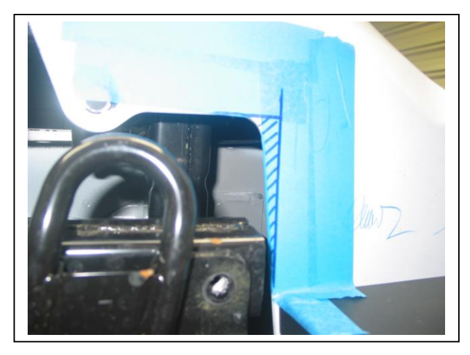
Figure 2: Trim 15mm from front edge of bumper shown.