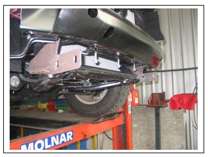
Figure 5: Steel mounts fitted to vehicle. Bumper removed for photo